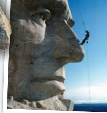
Each of the presidents' faces measures 60 feet from forehead to chin.

The monument is a grouping of four leaders who brought the country from colonial times into the 20th century. It memorializes the birth, growth, preservation and development of the United States.